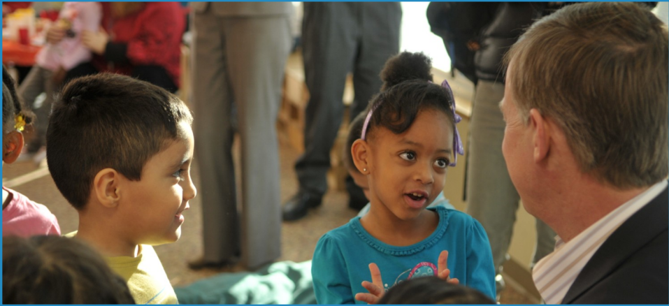
Greeting Children . 2011. Photograph. Clayton Early Learning Center, Denver.

Colorado's future success and prosperity depends today on the foundation our communities build for every child to thrive.