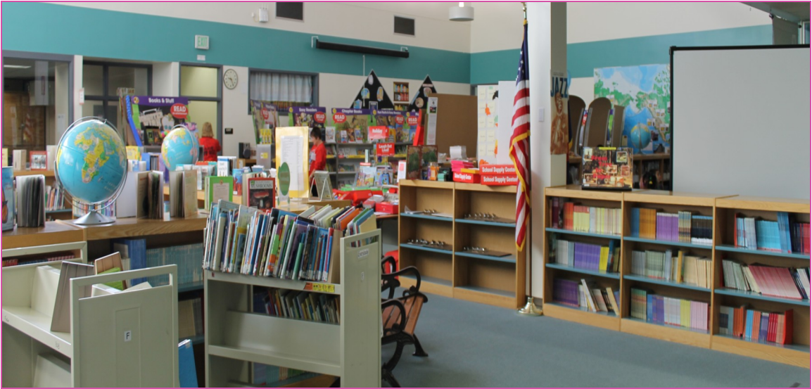
Library. 2011. Photograph. Martinez Elementary, Colorado Springs.