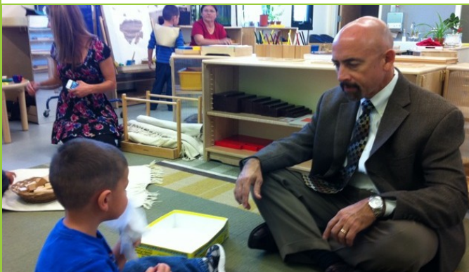
Lieutenant Governor Visits Head Start Classroom. 2011. Photograph. Mile High Montessorri, Denver.

across the system. Users can also forecast the return on investment, or long-term economic benefits , of certain programs. In this way, the cost model will help promote discussions and planning around early childhood policy and funding.